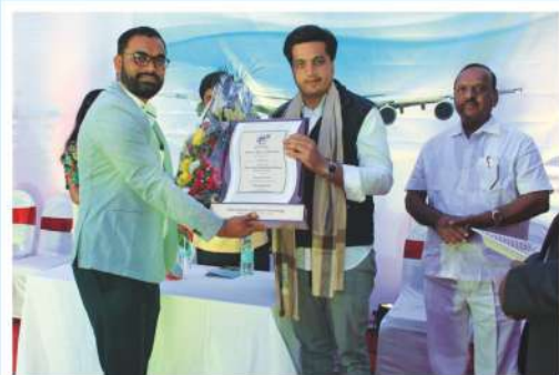
Our Founder Executive President greeting Hon. Mr. Rohitdada Pawar, MLA (Karjat - Jamkhed)