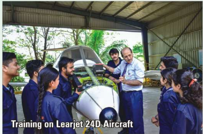
Training on Learjet 24D Aircraft