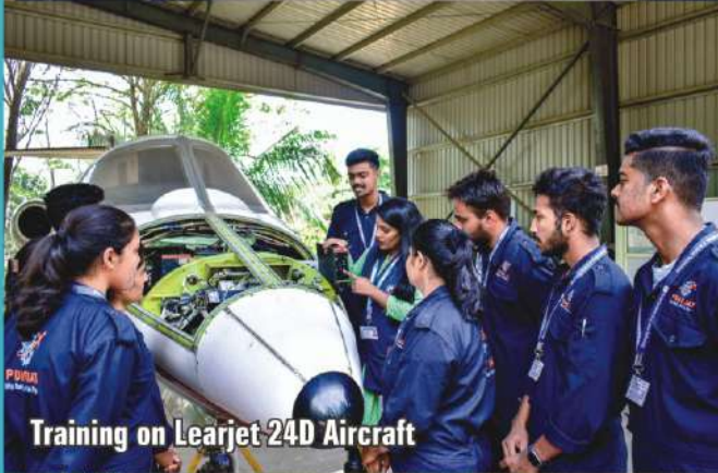
Training on Learjet 24D Aircraft