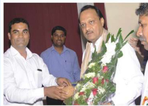
Our Founder Executive President greeting Hon. Mr. Ajitdada Pawar Ex. Deputy Chief Minister, Maharashtra