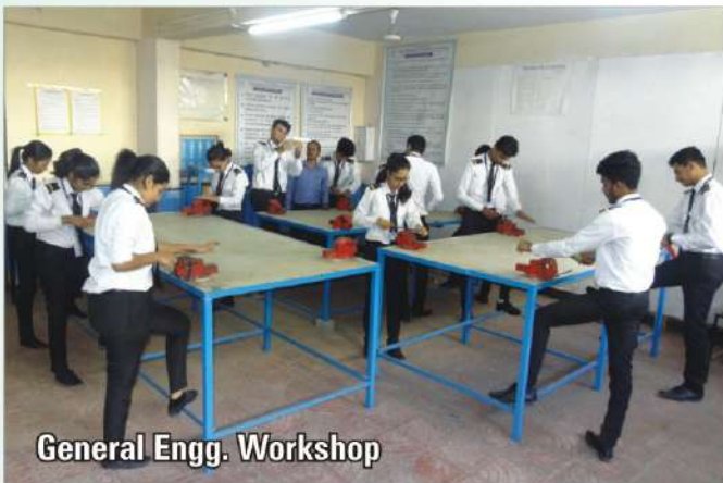
General Engg. Workshop