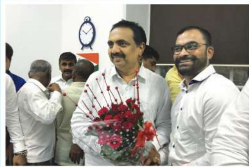
Our Founder Executive President greeting Hon. Mr. Jayant Patil, President NCP, Maharashtra, Ex. Water Resources Department Minister, Maharashtra