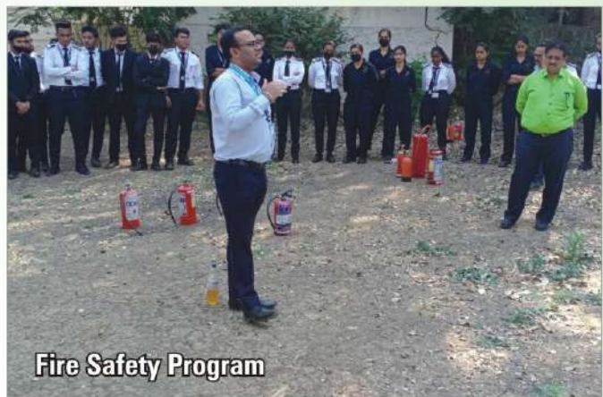
Fire Safety Program