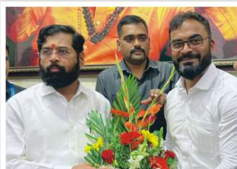
Our Founder Executive President greeting Hon. Mr. Eknath Shinde, Chief Minister, Maharashtra