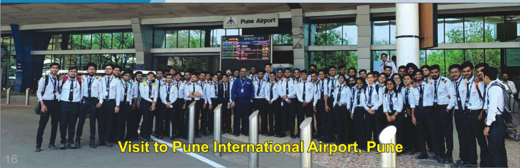
Visit to Pune International Airport, Pune