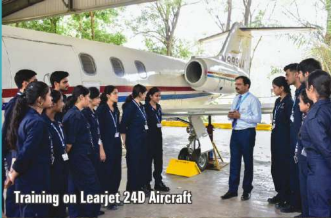
Training on Learjet 24D Aircraft

" Aviation is a branch of Engineering that is least forgiving of mistakes !"