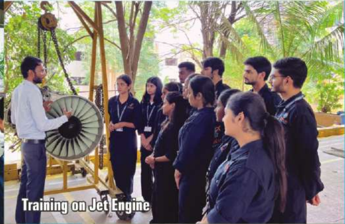
Training on Jet Engine