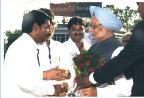
Our Founder Executive President greeting Hon. Dr. Manmohan Singh Ex. Prime Minister of India