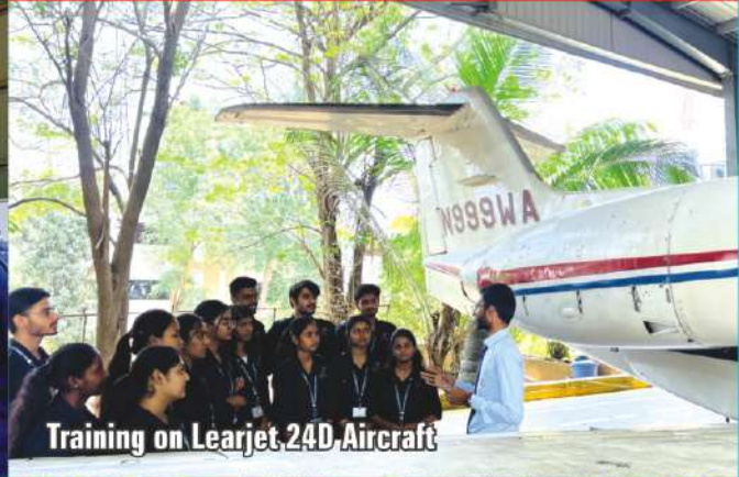
Training on Learjet 24D Aircraft