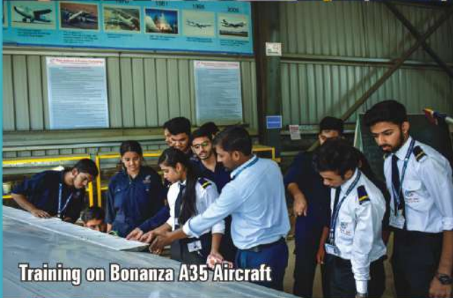
Training on Bonanza A35 Aircraft