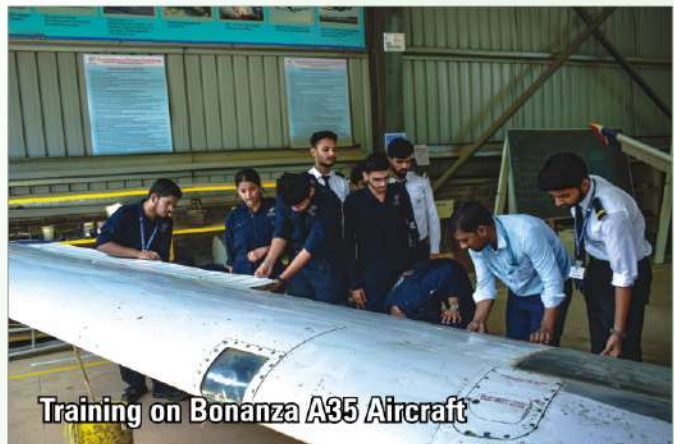
Training on Bonanza A35 Aircraft