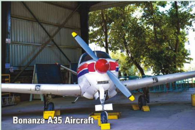
Bonanza A35 Aircraft