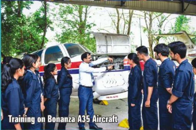
Training on Bonanza A35 Aircraft