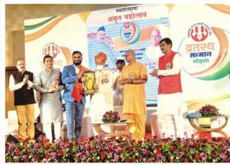
Our Founder Executive President greeted by Dr. Bhagat Singh Koshyari Hon. Governor of Maharashtra